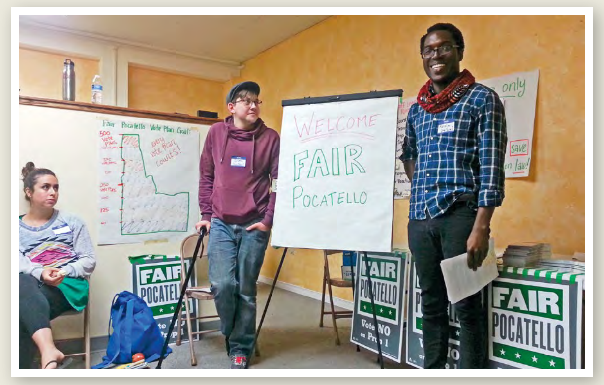
ALLIANCE FOR JUSTICE MEMBER: NATIONAL LGBTQ TASK FORCE ACTION FUND

MYTH: In challenging economic times, foundations should focus their resources on supporting the delivery of needed services.