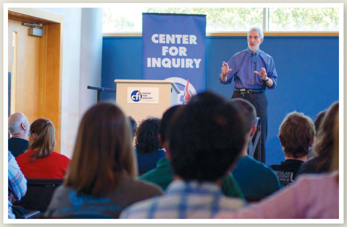
ALLIANCE FOR JUSTICE MEMBER: CENTER FOR INQUIRY

Supporting advocacy is an attractive grantmaking strategy for many foundations because it has so many multiplier and spillover effects.