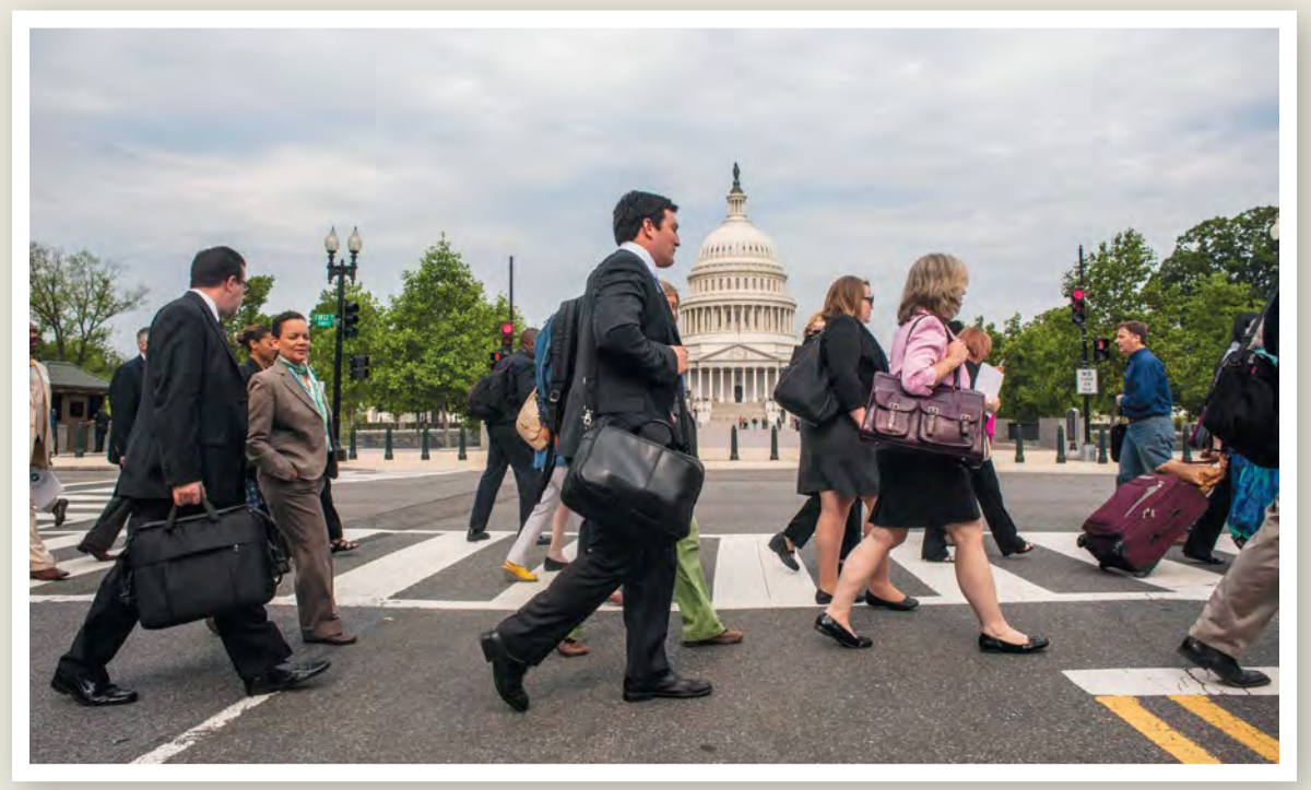
ALLIANCE FOR JUSTICE MEMBER: EARTHJUSTICE