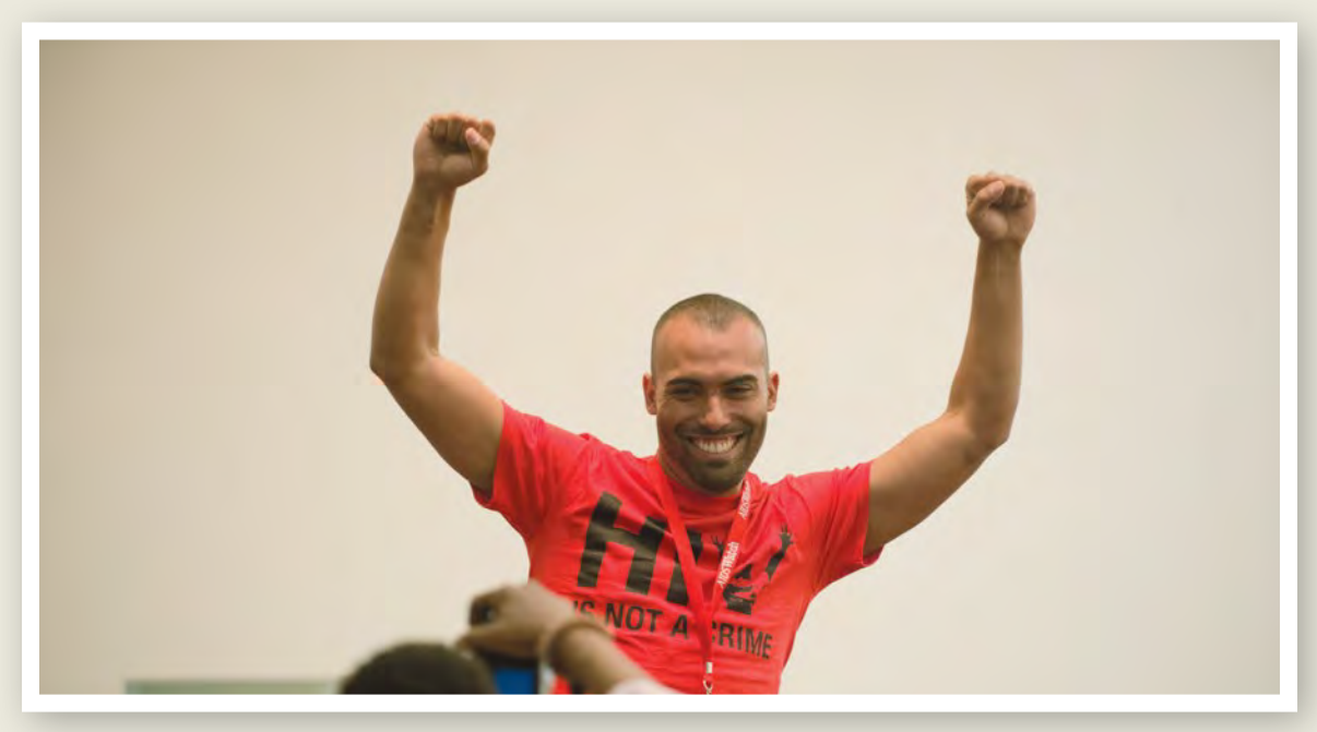
ALLIANCE FOR JUSTICE MEMBER: AIDS UNITED

In the previous section, we shared important rules and tools for both private and public foundations supporting their nonprofit grantees' advocacy and lobbying work. In this section, we will take the discussion a step further by describing what kinds of advocacy foundations can do on their own, independent of or in addition to the support they give to their nonprofit grantees.