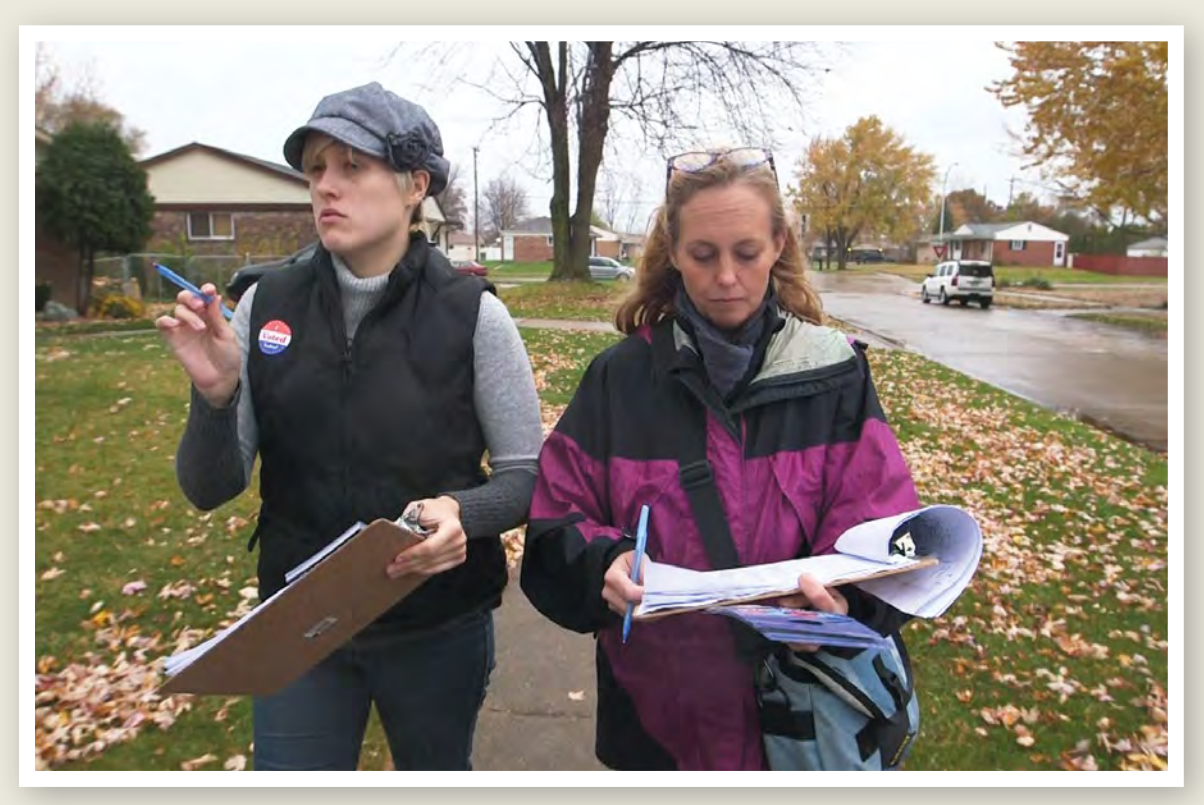
ALLIANCE FOR JUSTICE MEMBER: LEAGUE OF CONSERVATION VOTERS