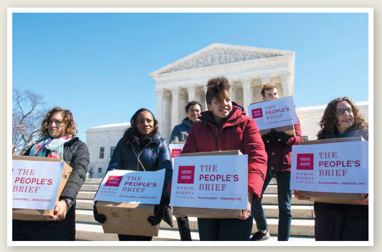
MEMBER: HUMAN RIGHTS CAMPAIGN

Donors who want their contributions to be used to change laws, support or oppose ballot measures, or advocate for candidates who champion certain beliefs should consider donating to a 501(c)(4) organization. Unlike 501(c)(3) public charities, 501(c)(4) social welfare organizations can engage in an unlimited amount of lobbying and a limited amount of work supporting or opposing candidates for public office. Both private and public foundations can support (c)(4) organizations when their activities advance the foundation's mission. Examples of 501(c)(4) organizations include the AARP, Sierra Club, National Rifle Association, Human Rights Campaign, Planned Parenthood Action Fund, American Cancer Society Cancer Action Network, and the League of Conservation Voters.