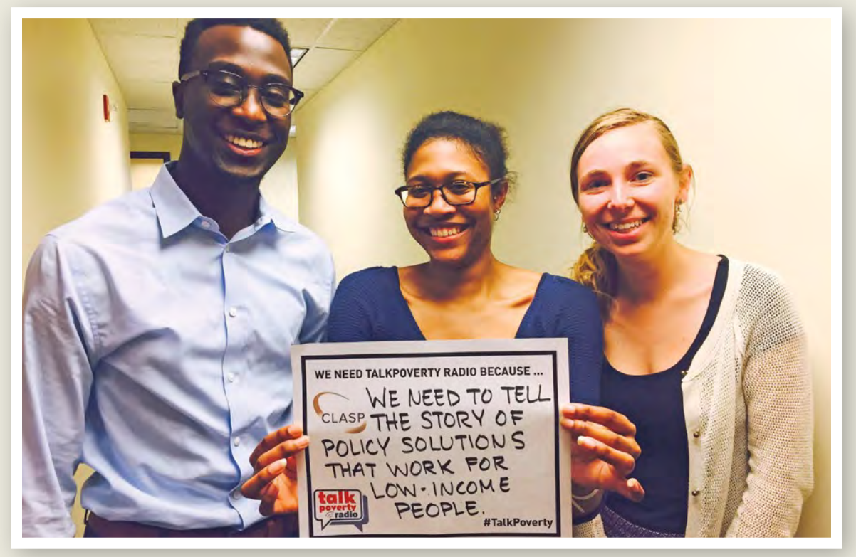
ALLIANCE FOR JUSTICE MEMBER: CENTER FOR LAW AND SOCIAL POLICY

When a foundation awards a grant to the local food bank to distribute food, grant reports from the food bank focus on how many meals were provided. However, when the state association of food banks gets a grant to secure more public funding for food assistance to serve many more people, its grant reports focus on very different metrics.