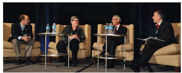
ALLIANCE FOR JUSTICE MEMBERS (CLOCKWISE FROM TOP RIGHT): NATIONAL CENTER FOR YOUTH LAW, MENTAL HEALTH AMERICA, THE ARC