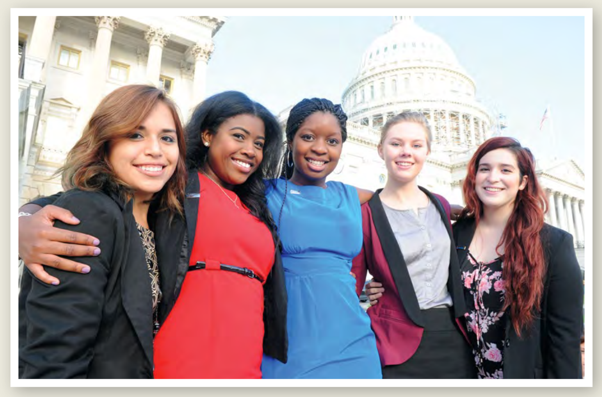
ALLIANCE FOR JUSTICE MEMBER: ADVOCATES FOR YOUTH/LLOYD WOLF

Advocacy is a skill that can be learned, developed, and cultivated. No organization has completely mastered all of the elements of good advocacy. If a foundation believes that advocacy can advance its mission, not only should it support groups that advocate, but it should look for ways to help those groups improve their capacity to advocate.